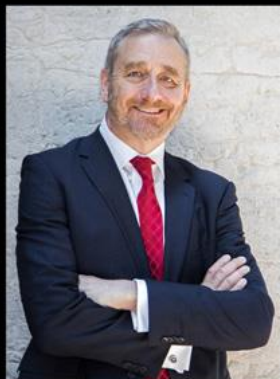
Attorney General Dave Yost Freedom Award