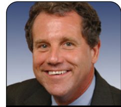
Sherrod Brown (D)