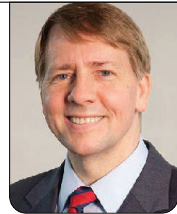
Richard Cordray (D)