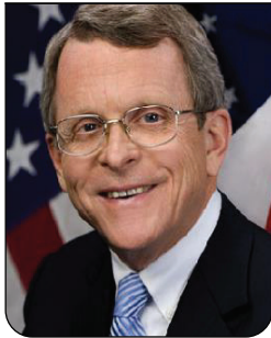
Mike DeWine (R)